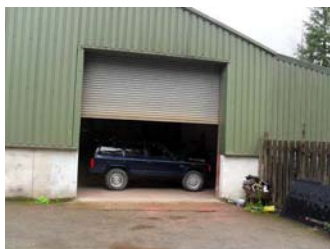
Ref: 3057 - Autospray