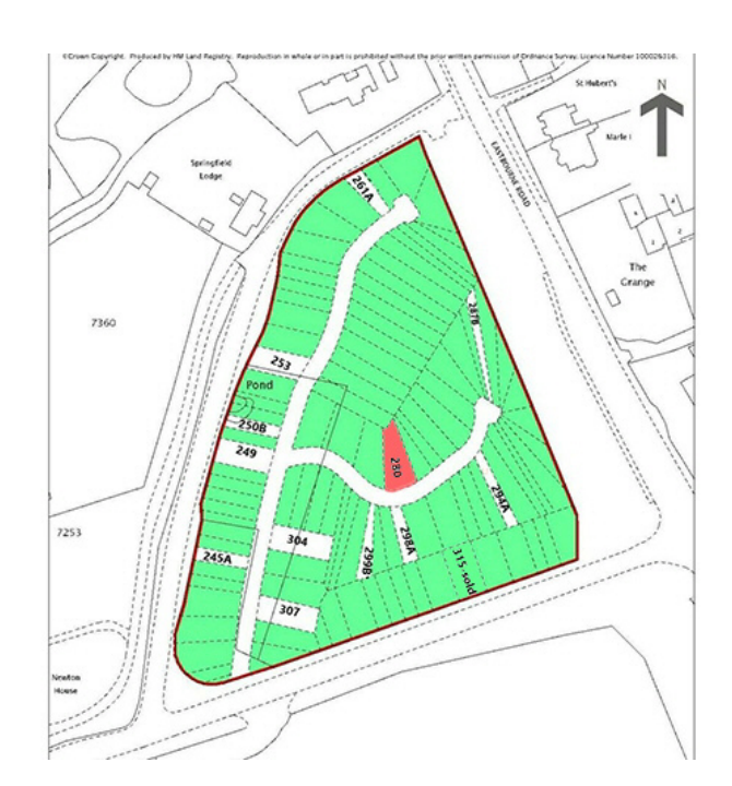
Byers Lane South Godstone Godstone Surrey RH9 8JH